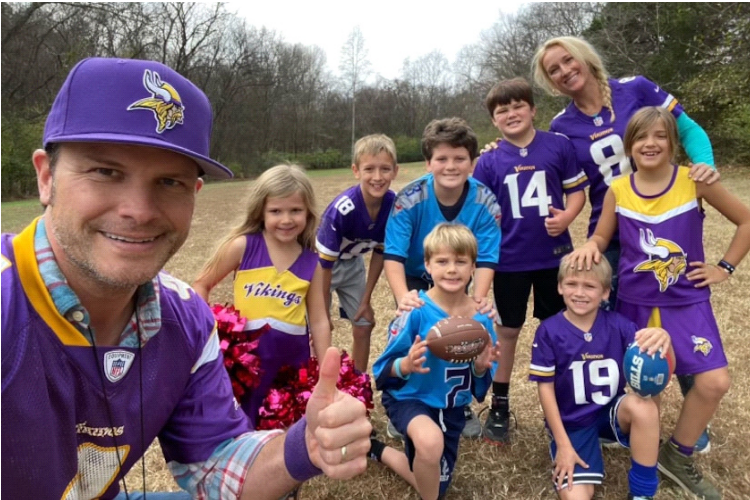
Secretary of Defense Pete Hegseth gives thumbs up to enthusiastic football fans